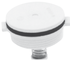
Hydrostatic Relief Valve