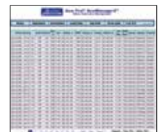
AcuCom and AcuManage II Software