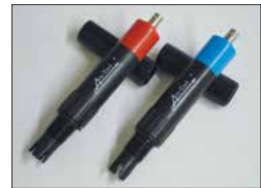
pH and ORP Sensors